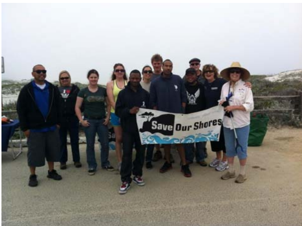
Asilomar Beach – May 11, 2013